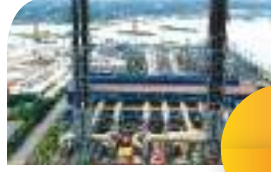
Kodda 150 MW Power Plant